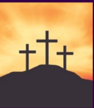
GOOD FRIDAY The Penitent Thief