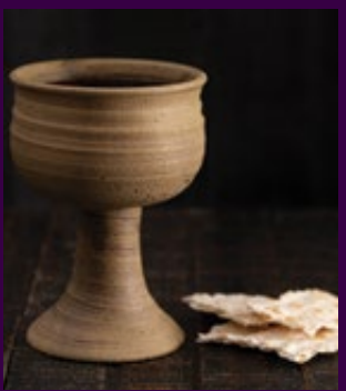
MAUNDY THURSDAY John