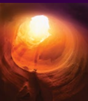
EASTER SUNDAY Mary Magdalene