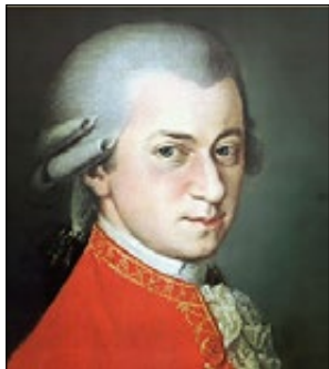
Wolfgang Amadeus Mozart

PP. 72-73 WEEK OF JANUARY 19-25, 2020 WORD: CASTING