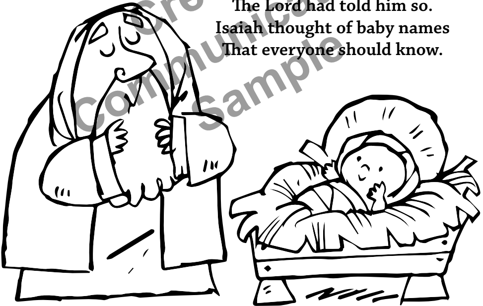
Color Isaiah standing by God's promised child.

Isaiah knew a child would come. The Lord had told him so. Isaiah thought of baby names That everyone should know.